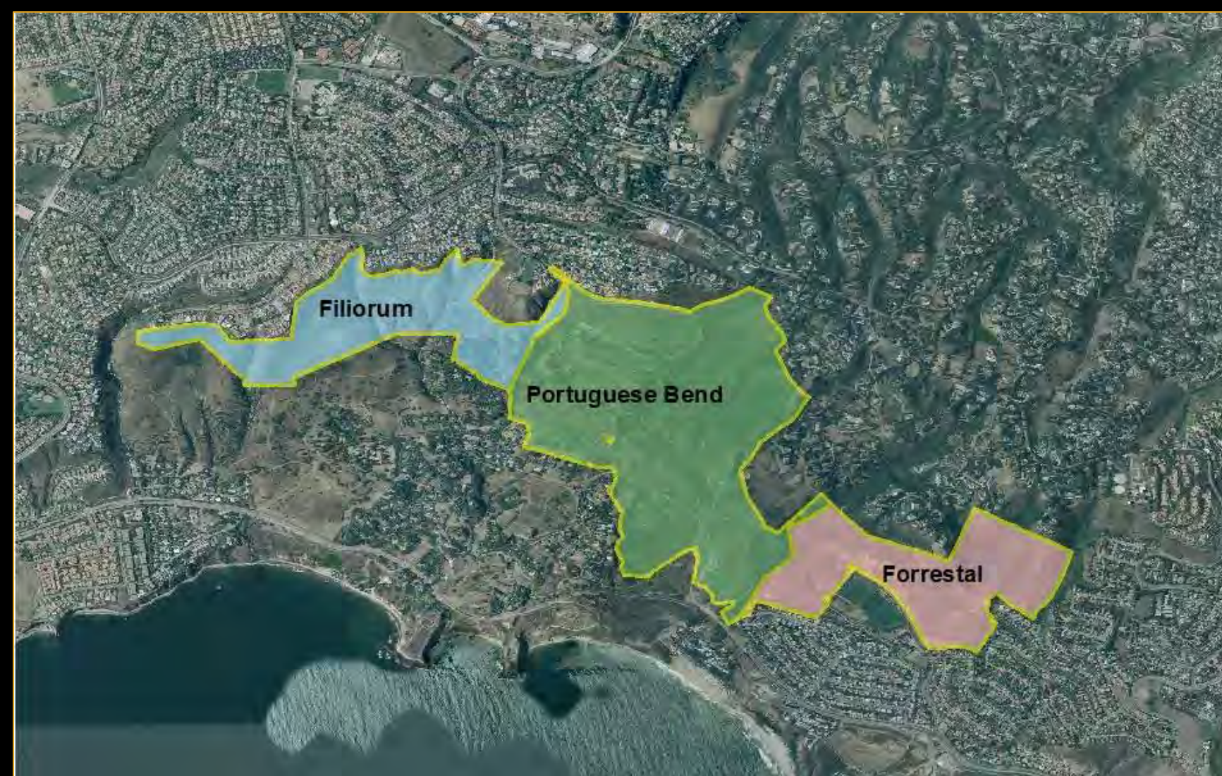
Figure 1. Location of Filiorum, Portuguese Bend, and Forrestral Reserves on the Palos Verdes Peninsula

The coyotes of the Palos Verdes Reserve live in a wildland urban interface which is a transitional zone between unoccupied land and human development. It is believed that this kind of environment influences what the coyotes eat. We focused on prey consumed by coyotes and contrast our results with those obtained in other areas, particularly the Santa Monica Mountains. Monitoring was also done for the National Communities Conservation Plan (NCCP)