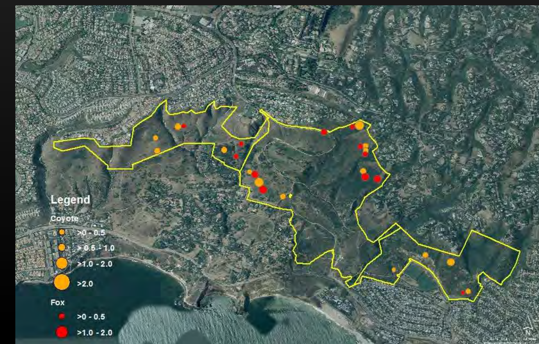
Figure 3. Normalized coyote and fox scat deposition 2014-15.